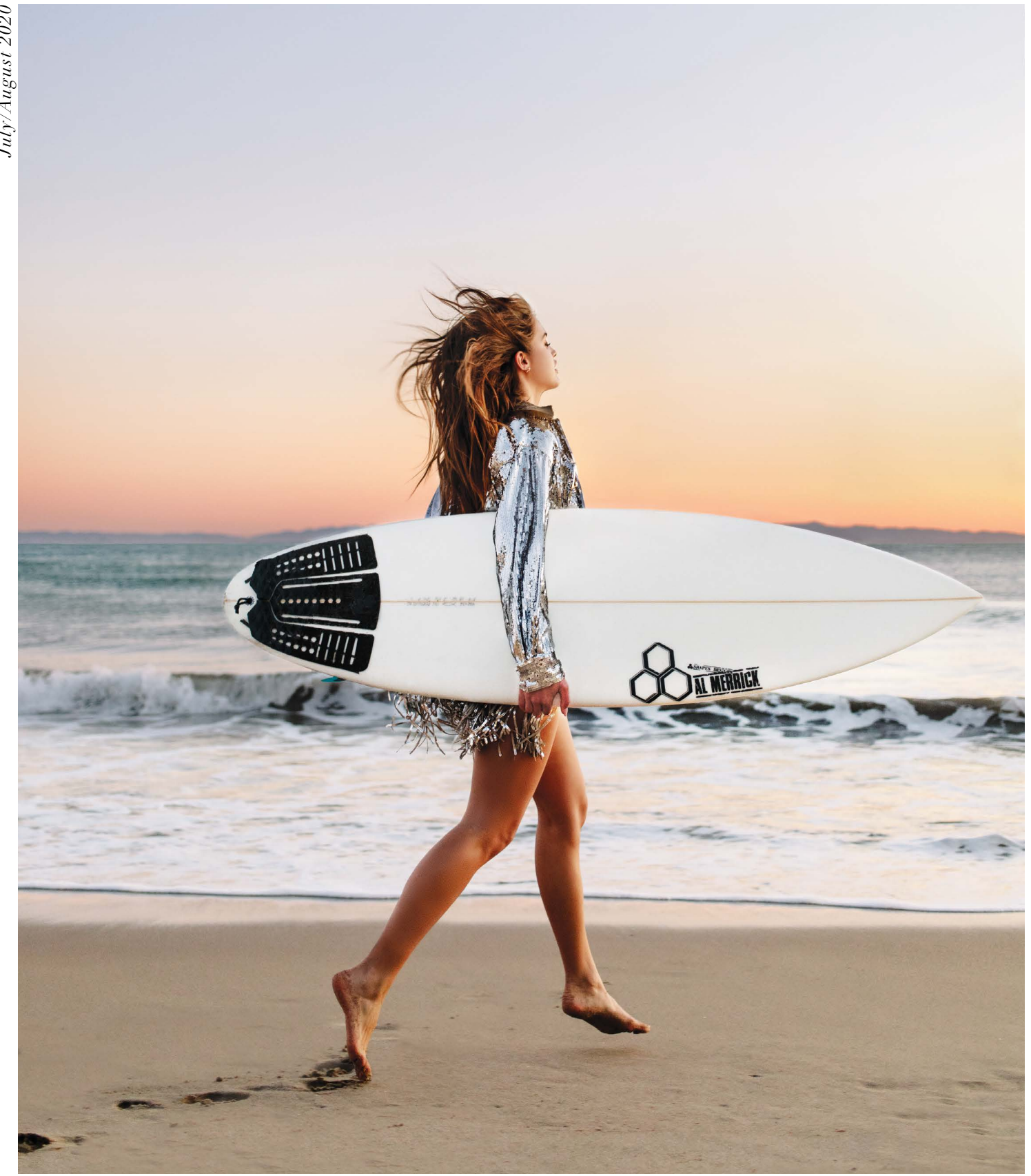
SUMMER LIKE YOU MEAN IT