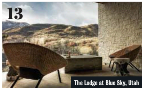
The Lodge at Blue Sky, Utah