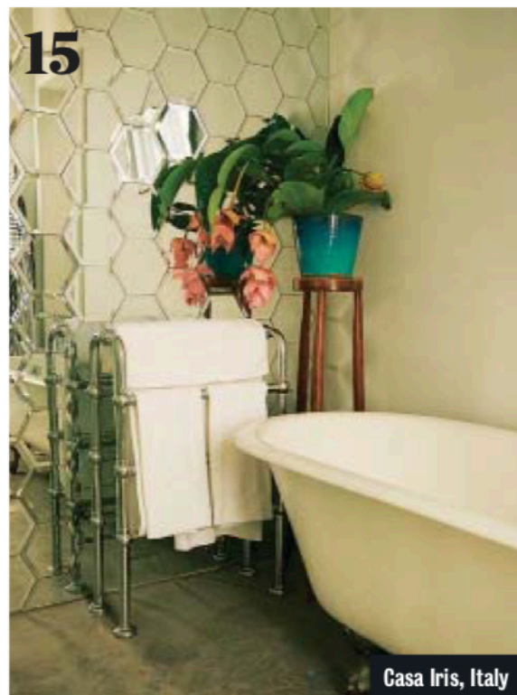
Casa Iris, Italy